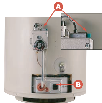
A. Easy-to-light piezo igniter